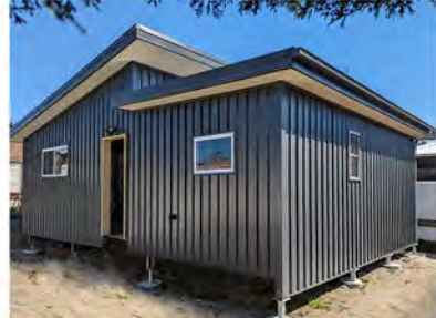
6. Lock up!

With our help you can save $30,000+ on builders quotes by taking care of the interior yourself