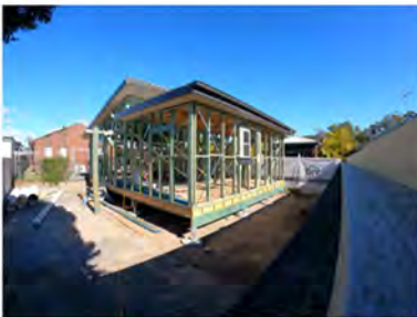
4. Roofing and windows