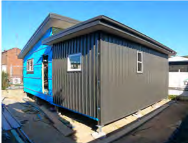
5. Cladding or bricks